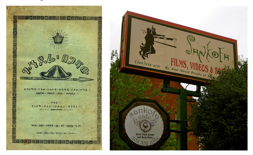
Figures 3 & 4: The cover of Abba Gerima's book 'Gondere Begashaw' and the logo of Negod – Gwad Production

companies in North America. They also run Sankofa Video and Books, which they call "a liberated territory for independent thinking,"<sup>29</sup> specializing in African and African American films.<sup>30</sup> Mypheduh Mod P means "sacred shield" for the holy bread in the Ge'ez (Ethiopic) language and ecclesiastical vocabular, a nickname given to Haile Gerima by his father. Icons and names blended together.