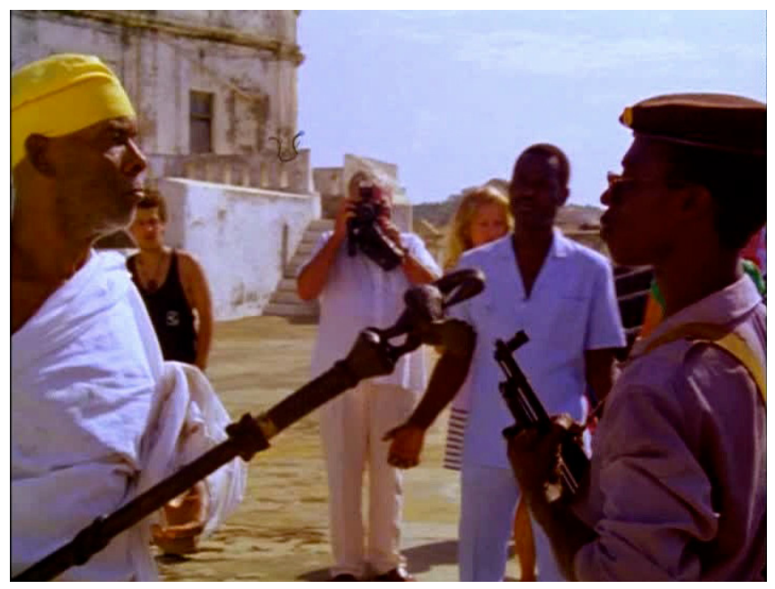
Figure 5: Memory vs. Militarism from Sankofa (1993), Courtesy of Haile Gerima

Korea, in Russia, in Albania." Repetitive monologues of naming foreign ideologies from the mouth of intellectuals in the Diaspora is a sound track of Anberber's nightmare.