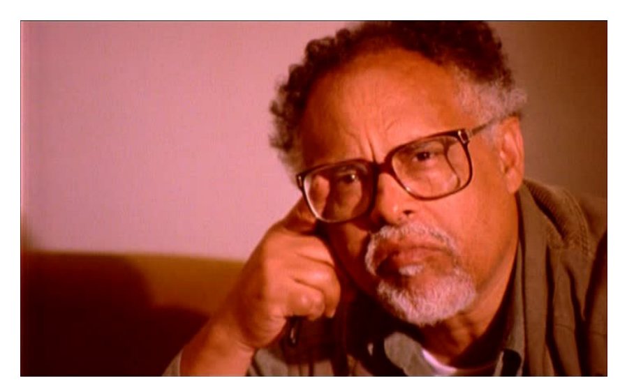
Figure 6: Invisible Colonialism – Haile Gerima in the documentary Adwa interviewing, courtesy of Haile Gerima

down on oral sources when they began writing history. What they neglected was not only the folkloric orality, oral-literature (orature), and oral history, but also the iconographic and even written texts. Gerima explained that, "Often Ethiopian historians borrowed from Europeans, the very Italians we defeated, the very British and French who collaborated with Italians for the invasion of Ethiopia in 1935. Ethiopian historians go to them as sources, instead of researching from our own Ethiopian folkloric and oral traditions."56 There are many examples of historians following such a paths of elitists.<sup>57</sup> For now, it is suffice to mention a recent book that deals with the subject of miseducation by Yirga Gelaw Woldeyes, Native Colonialism: Education and the Economy of Violence against Traditions in Ethiopia, The Red Sea Press, 2017. The authors pause the following questions: Why did a country that was never colonized replace its government, legal system and educational institutions with foreign imitations? How did ti come to have a European language as aits medium of higher education and why was the rich philosophy, literature, history of the country replaced by western knowledge? What is the impact of this process in the identities and daily lives of contemporary Ethiopian students? Next, we shall see how an indigenous knowledge system namely storytelling or the fire-aroundeducation represented and used in Gerima's works.