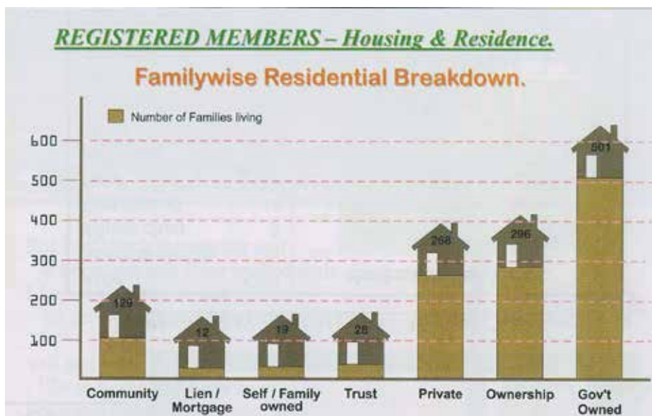
Figure 6: Survey data of housing breakdown by ownership status of the Dar es Salaam Khōjā, 2008. (Census Committee- Dar es Salaam, 2008)

The opening of markets was initially beneficial to the Khōjā as they had maintained their transnational links with other Khōjā communities in the region, such as Dubai. They imported manufactured goods by the container. According to a respondent, “in those times were able to buy a thing for $10 from Dubai and sell in Dar for $100.” 6 The profit margin was so high and the need of Tanzania so great for manufactured goods that an entire generation of Khōjā boys did not complete higher secondary education and/or university and instead worked at the family business importing and exporting goods. With the demand satiated, the economy stabilized in the late 1990s and competition from African merchants meant that an entire generation of Khōjā men without higher education qualifications or technical skill was unable to compete in the emerging service economy of Dar es Salaam. This ‘container culture’ 7 generation of men and their families has slipped from the middle-class to upper lower class in the matter of a decade and are routinely in need of the community’s welfare assistance.