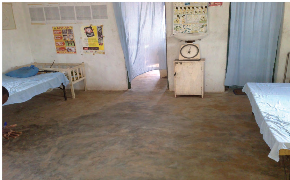
Figure 5: The Two Beds Available at the Health Centre

Like many other rural areas in Nigeria, the people of Okanle and Fajeromi have limited access to basic social amenities including health care facilities. The roads leading to both communities from both Arugbo and Idofian are not tarred and as a result difficult to traverse. The only community health centre that served the people was established in 1978 through the initiatives of both communities. The facility has however been taken-over the State Government. As at the time of the study, the community health centre had no designated medical doctor. The facility was run by a nurse. Thus, health matters, including malaria, were usually handled by the only designated nurse. Indeed, the hospital lacked basic health facilities with just two beds in a dilapidated building (see figure 5 and figure 6). Most of the rooms in the health centre have been abandoned because the roofs were collapsing. The people sometimes travel to Idofian or Ilorin to consult with medical professionals where health problems are beyond herbal medicines and the capacity of the village facility or where health providers are not available for consultation.