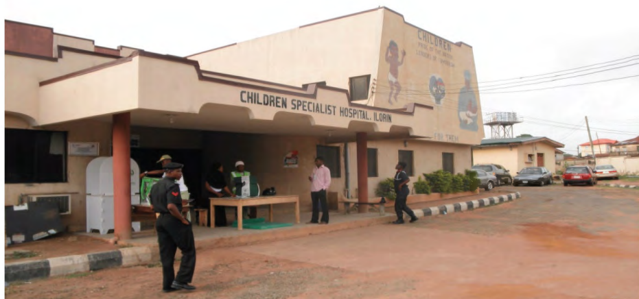
Figure 4: The Children Specialist Hospital

At the time of the study, the Children Specialist Hospital had a staff contingent of about 65 nurses with only two permanent medical doctors [a consultant and a general practitioner] assisted by at least four medical doctors of the NYSC. The laboratory scientist is supported by a lab technician; two X-ray technicians with two supportive staff; a pharmacist with about four supporters and a nutritionist. Despite the fact that the hospital is one of the highest revenue-generating hospitals in the State, according to one of the staff interviewed, the hospital is faced with numerous challenges. At the time of the study, the hospital did not have oxygen cylinders or refrigerators. The weighing scale and suction pump were non-functional. There was erratic power supply and insufficient medical doctors. Recently, a non-governmental organisation (NGO) known as the Wellbeing Foundation came to the rescue of the hospital. The NGO helped to give the hospital its present new look when it undertook the renovation with the provision of a borehole for water supply, a children's ward, a doctor's consulting room, nurses' bay and bathrooms in the maternity unit, an ambulance and mosquito netting throughout the facility. Figure 4 presents the pictorial characteristic of the Children Specialist Hospital.