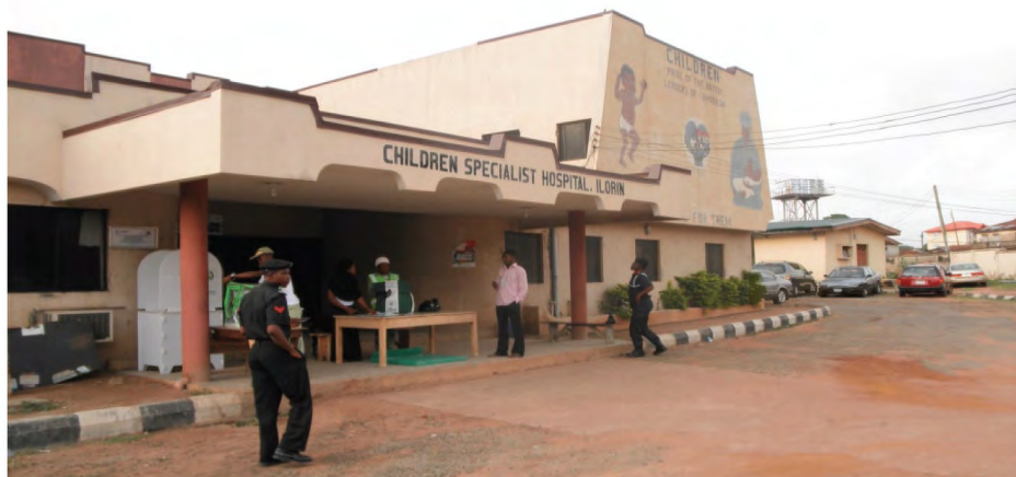
Figure 4: The Children Specialist Hospital

At the time of the study, the Children Specialist Hospital had a staff contingent of about 65 nurses with only two permanent medical doctors [a consultant and a general practitioner] assisted by at least four medical doctors of the NYSC. The laboratory scientist is supported by a lab technician; two X-ray technicians with two supportive staff; a pharmacist with about four supporters and a nutritionist. Despite the fact that the hospital is one of the highest revenue-generating hospitals in the State, according to one of the staff interviewed, the hospital is faced with numerous challenges. At the time of the study, the hospital did not have oxygen cylinders or refrigerators. The weighing scale and suction pump were non-functional. There was erratic power supply and insufficient medical doctors. Recently, a non-governmental organisation (NGO) known as the Wellbeing Foundation came to the rescue of the hospital. The NGO helped to give the hospital its present new look when it undertook the renovation with the provision of a borehole for water supply, a children's ward, a doctor's consulting room, nurses' bay and bathrooms in the maternity unit, an ambulance and mosquito netting throughout the facility. Figure 4 presents the pictorial characteristic of the Children Specialist Hospital.