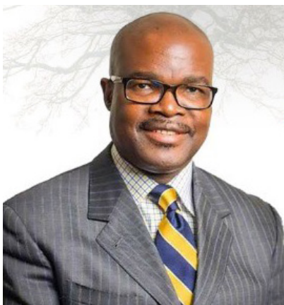
Paul Tiyambe Zeleza