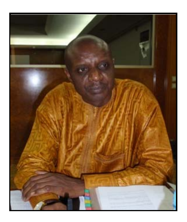
New Executive Secretary